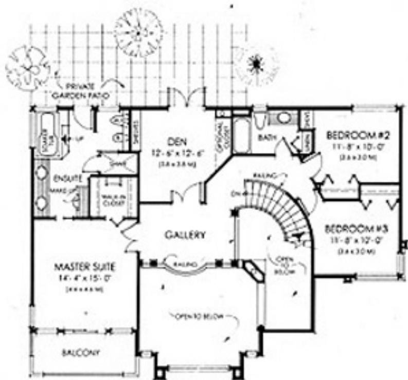
SECOND FLOOR PLAN 1225 SQ.FT. (113.8 M 2 )

WIDTH - 60'- 8" (18.5 M) DEPTH - 37'- 6" (11.4 M)